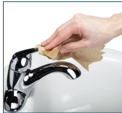
USE PAPER to shut the tap