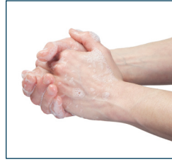
RUBS FOR 15-20 seconds